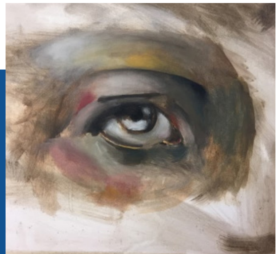
Painting By Scholarship Winner Jessica Lensmire

May 28th Art Walk on Main Street 4:30 pm - 7:00 pm Art Walk includes art displays in over 30 downtown businesses as well as a free raffle and children's activities